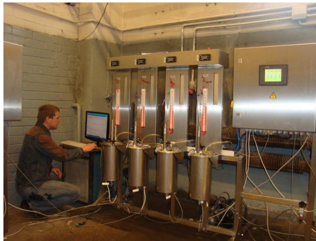
Fig. 1. Laboratory equipment B4

In our research we used methods similar to those described in the works [5-8]. Biogas yield was investigated using two laboratory equipments B4 consisting of 8 digesters operated in batch mode (Figure 1). Each digester was of 6 l volume and was equipped with heating devices for automated regulation of temperature 38 \pm 1 °C in digesters. Digesters were equipped with sensors for automated registering of pH and gas volume data in the computer.